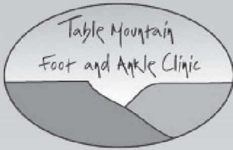
Table Mountain Foot And Ankle Clinic

3555 Lutheran Parkway • Suite 120 Wheat Ridge, Colorado 80033 303.422.6043 (p) • 303.422.0551 (f)